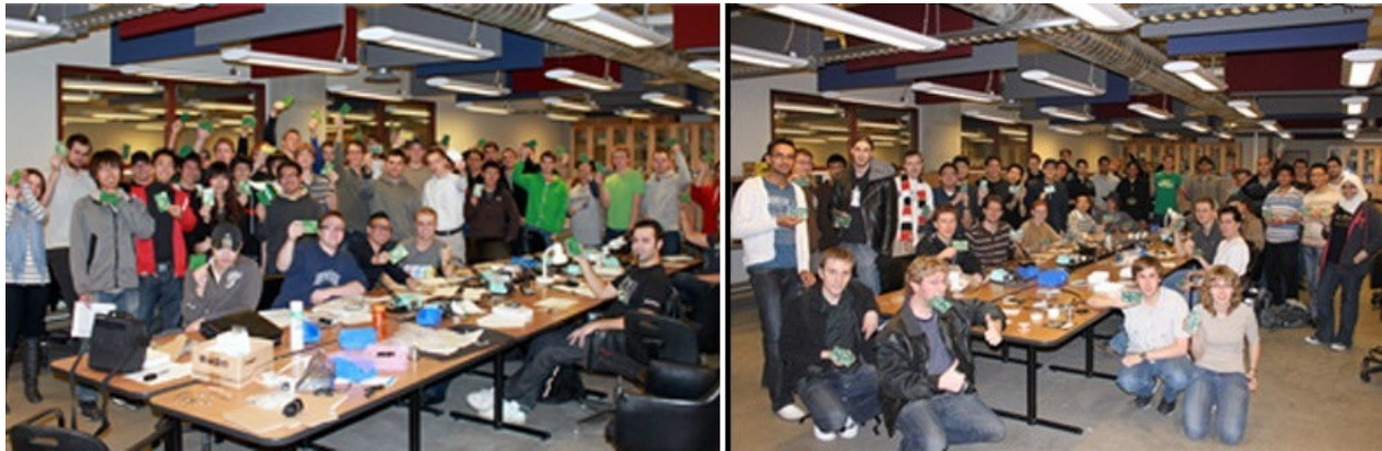
2010-2011 MPG Level 1 and Level 2

The technical side of MPG is definitely beneficial and the networking side is also extremely valuable. With the addition of the second weekly session in 2010, initial participation last year was an astounding 120 students, and just about the same number are attending this year. To date, over 600 students have experienced MPG and new emphasis has been placed on growing an MPG community that students stay involved in throughout their academic and industry careers. MPG is also trialing a “remote” offering of the program this year at other Canadian universities, with schools involved from coast to coast!